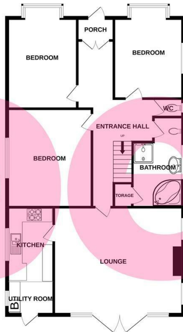
GROUND FLOOR 1212 sq.ft. (112.6 sq.m.) approx.